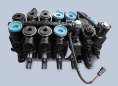
The new Dynamic load sensing hydraulic steering system contributes to reduce loss of hydraulic and improve energy efficiency.