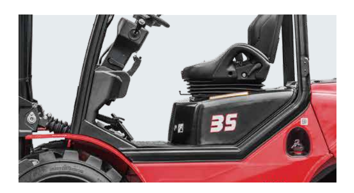
The easy-to-open hook provides quick access to the engine compartment.

Newly-developed LCD instrument has more comprehensive functions and more stable performance and entirely displays the full truck state, fault code and other important information, which can make the operator more intuitively and conveniently have a better knowledge of truck state and make the maintenance conveniently.